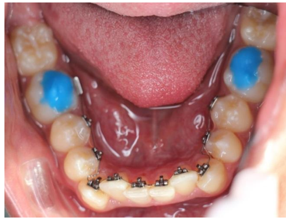
Patient 16 J. 19.9.2013